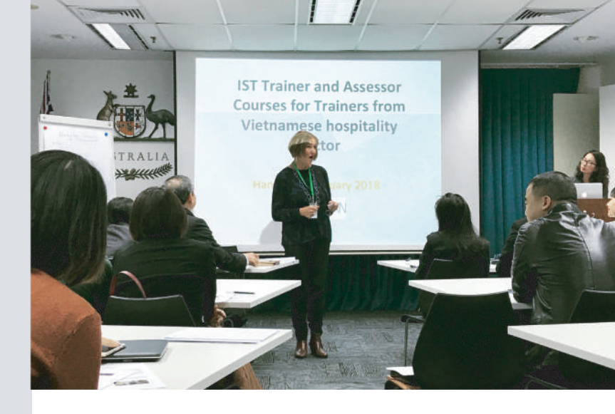
Photo from the workshop on International Skills Traning (IST) Courses for Trainers and Assessors - 30 January 2018, Australian Embassy in Hanoi

The roundtable discussion was followed by a site visit to Silicon Straight Saigon, one of the most dynamic start-up ecosystems and incubators for young innovators in Ho Chi Minh City.