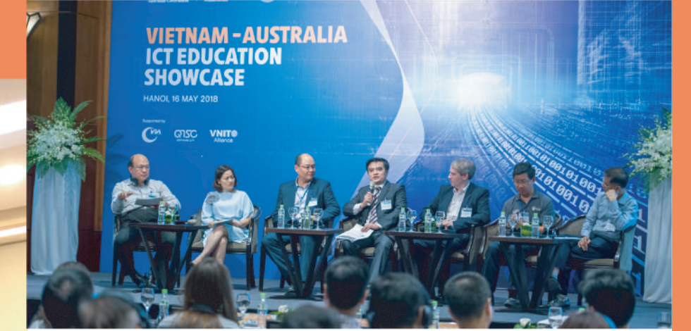
Photo from Vietnam-Australia ICT Education Showcase 2018 – 16 and 18 May 2018, Hanoi and Ho Chi Minh City