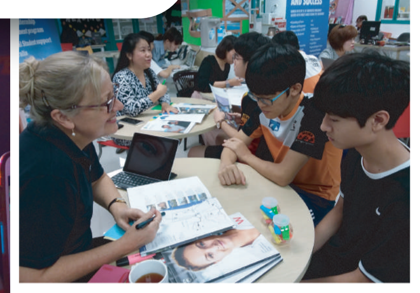
Photo from Future Unlimited School Campaigns - 11 May 2018, Hanoi International School